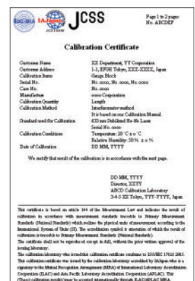
(Example of JCSS Calibration Certificate)